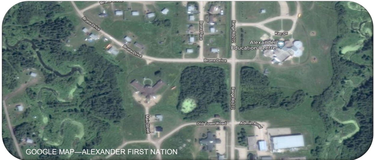
GOOGLE MAP—ALEXANDER FIRST NATION